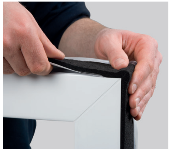
Installation example: ISO-BLOCO ONE

* Movement in structural elements and temporary longitude changes are to be taken into account by the max. joint width.