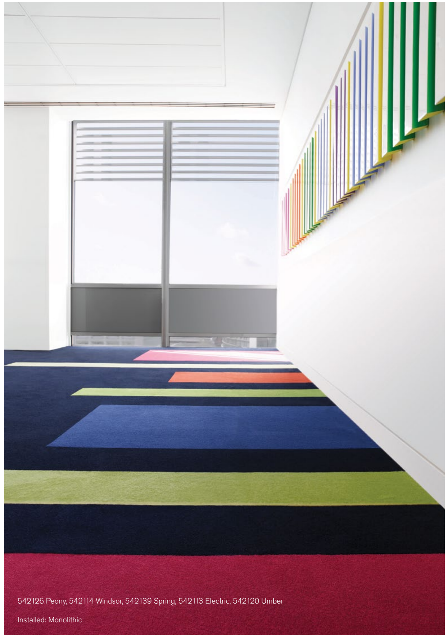
542126 Peony, 542114 Windsor, 542139 Spring, 542113 Electric, 542120 Umber