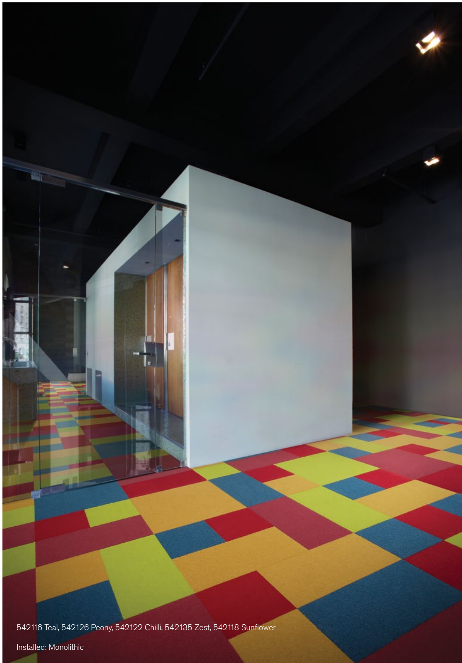
542116 Teal, 542126 Peony, 542122 Chilli, 542135 Zest, 542118 Sunflower