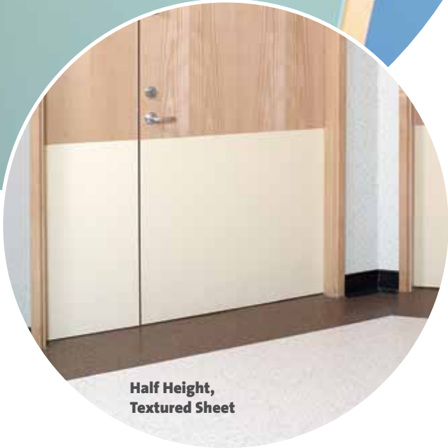
Half Height, Textured Sheet