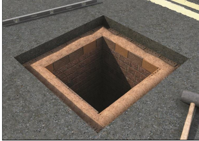
Figure 3 Application of bedding mortar to the prepared substrate

11.2 When packing materials are used to support and level the frame, they must be compatible with the bedding mortar to be used. The Certificate holder can advise on suitable materials.