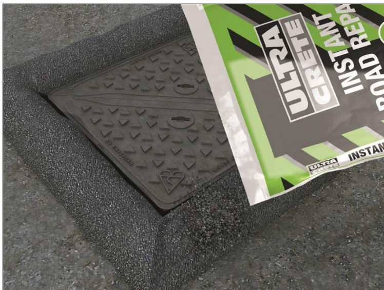
Figure 7 Installation of Ultracrete Instant Road Repair

11.13 Vertical edges are sprayed again using the Ultracrete Seal and Tack, and Ultracrete Instant Road Repair is applied with a 50% excess. The material is then compacted level with the existing surface course (see Figure 8).