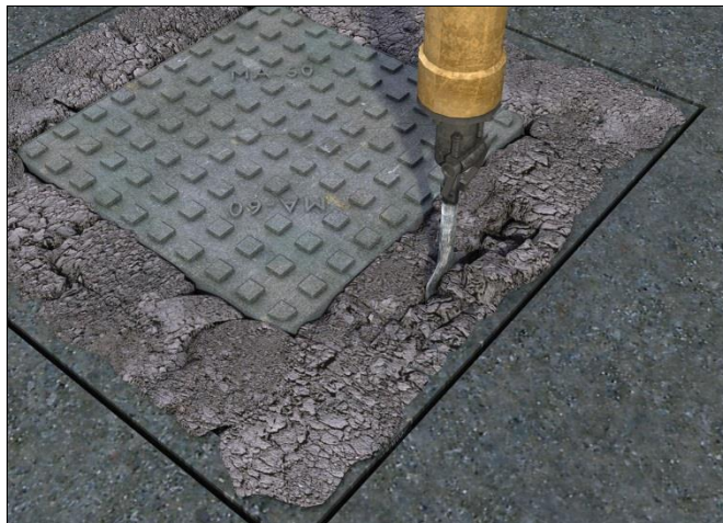
Figure 2 Excavating failed ironwork

10.4 All old bedding mortar is removed and the supporting structure cut back or loose bricks removed until a sound base is achieved.