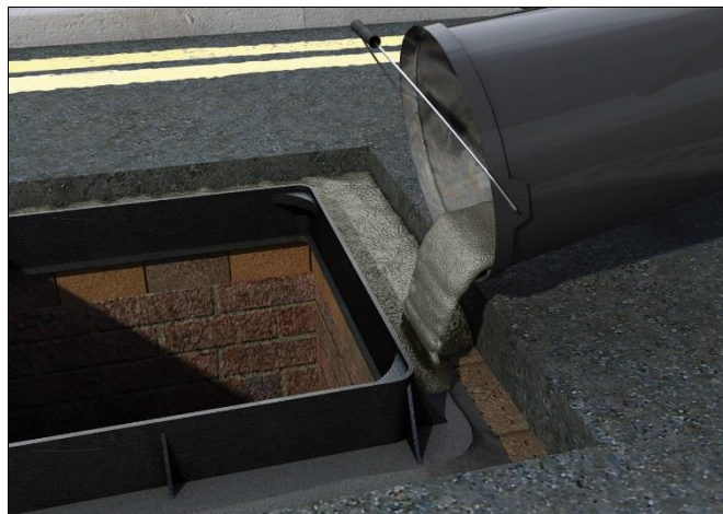
Figure 5 Backfilling using Ultracrete QC10 or Ultracrete QC10F

11.11 Once Ultracrete QC10 and QC10F has reached initial set, all vertical edges of the excavated area and the manhole frame are sprayed with Ultracrete Seal and Tack, ensuring all surfaces are covered (see Figure 6).