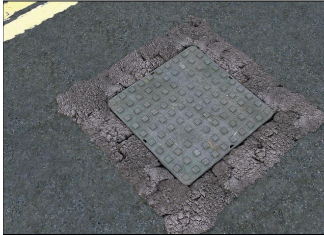
Figure 1 Failed ironwork

10.2 The supporting structure must be of adequate size and strength to support the frame, cover and expected loading.