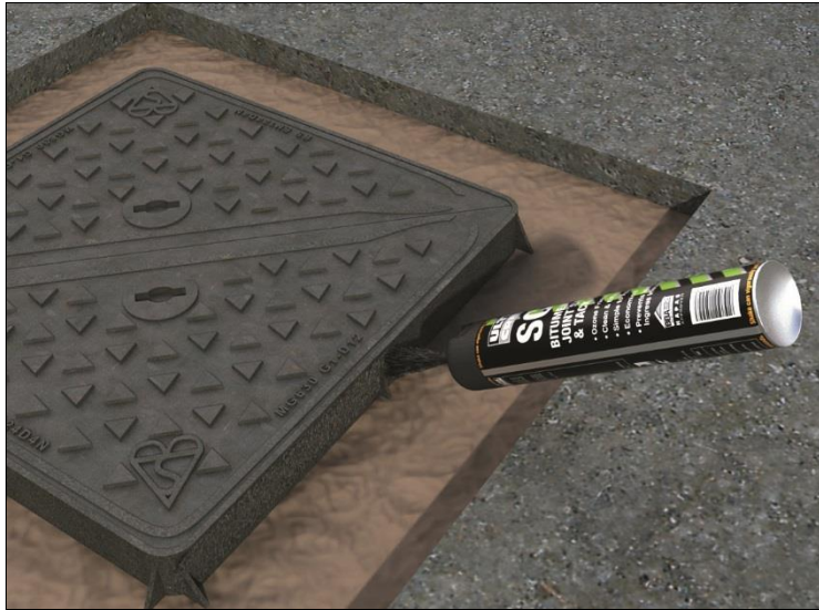
Figure 6 Application of Ultracrete Seal and Tack

11.12 Ultracrete Instant Road Repair is applied to a depth of approximately 45 mm and compacted to 30 mm (see Figure 7).