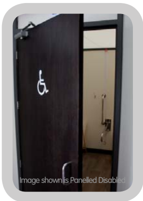
Image shown is Panelled Disabled