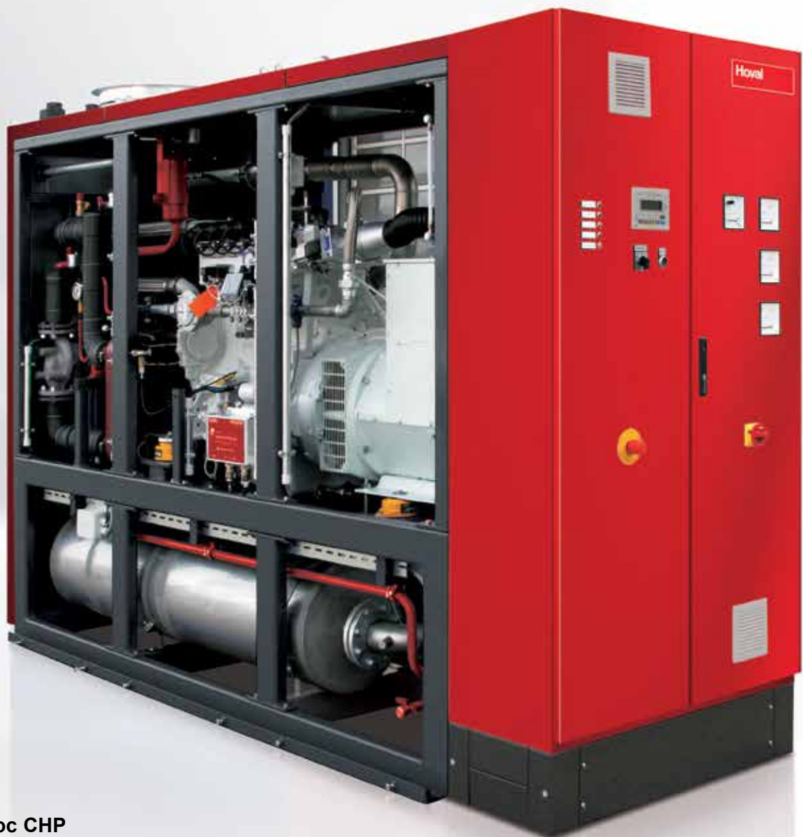
PowerBloc CHP High efficiency cogeneration

The Hoval PowerBloc CHP unit provides extremely high efficiencies and offers numerous features that make it an excellent choice for upgrades and new installations. At Hoval we can help engineer the perfect system for almost any application.