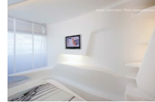
There can be no dirt build up where there are no joints. HI-MACS® can be simply and easily joined seamlessly.