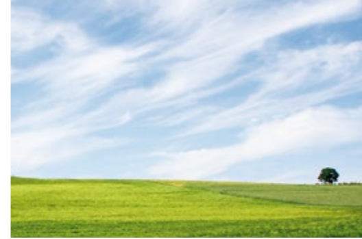
HI-MACS® is an ecological material. Its mineral and acrylic composition, environmentally-friendly and virtually "waste-free" manufacturing process give it top marks in terms of "eco-friendliness."

HI-MACS® is hard-wearing, extremely repellent to stains and is therefore very easy to look after. We would like to provide you with a few simple tips and hints for caring for your product so that you can enjoy its exceptional quality for many years to come.