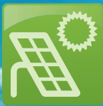
150W Heat MatPV