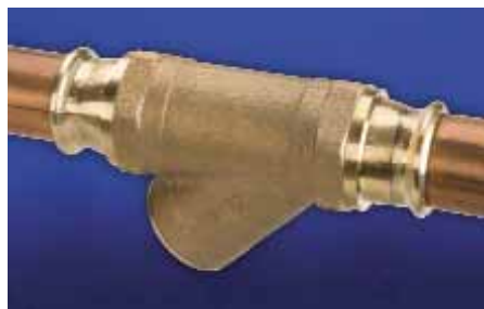
Fig. 817.PF Pressed