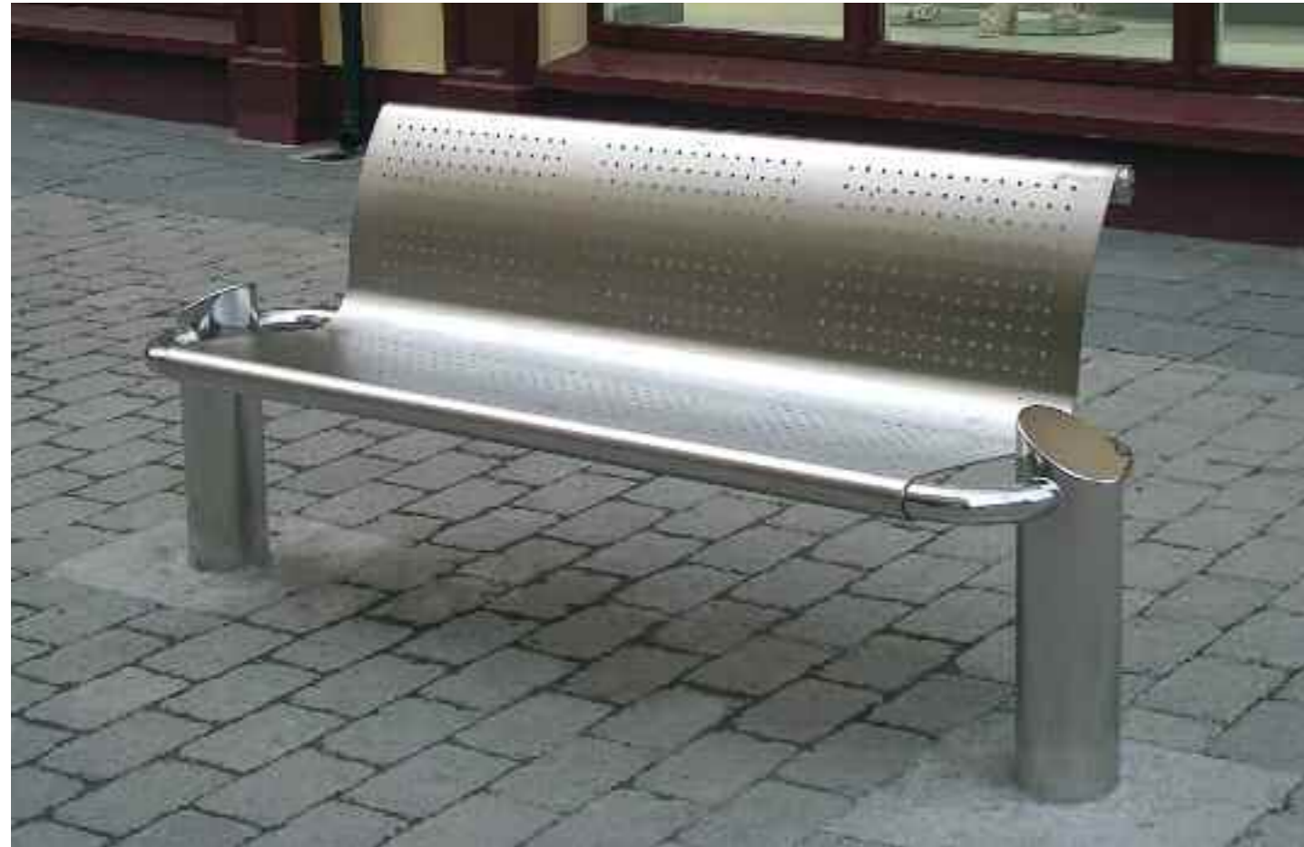
HC2040S Seat Length: 1870 mm ( Root Fixed )