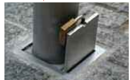
Stainless steel flip lid socket.