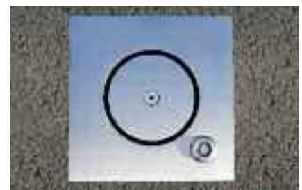
Stainless steel flush socket.