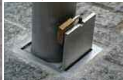
Stainless steel flip lid socket.