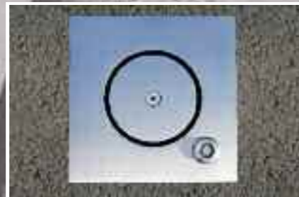
Stainless steel flush socket.