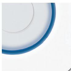
469 Neptune Blue