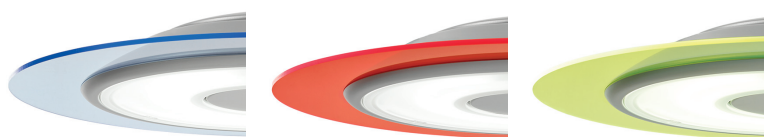
326 Neptune Blue