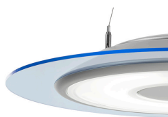
326 Neptune Blue