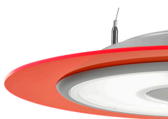
327 Mars Red