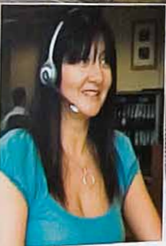
A friendly service.