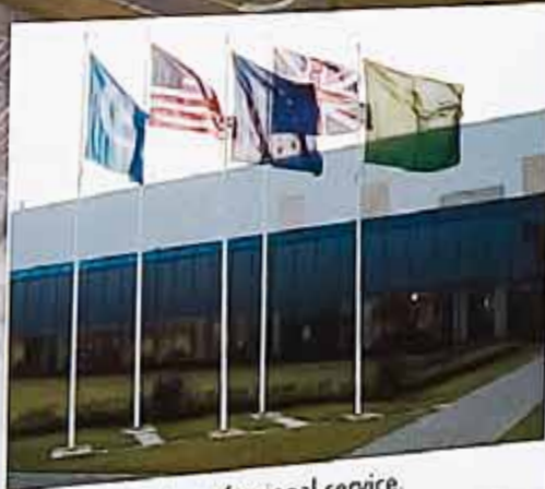
A professional service.

A pleasure to serve - All our staff enjoy working with our customers and our customers enjoy working with us. We believe business can be fun. Our sales and technical teams are not just traditional sales people and technicians, like you, they are business people bringing a wealth of knowledge and experience to you. They have the authority and expertise to make quick decisions free from time consuming bureaucracy. Whether our people are working in the field with you, or in the office you can be sure they will do their best for you and your business.