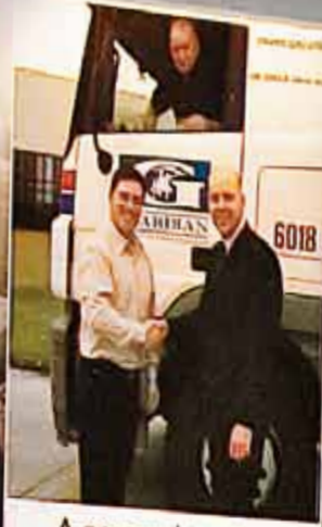
A personal service.

Your independent business partner Your glass manufacturing plant is here to provide you with the quality products and services you need for your business to grow profitably. Everything we do here is focused on you the customer. We seek to constantly improve our products, services and support for you. Our people believe passionately in the spirit of the entrepreneur, free enterprise and healthy competition. They are empowered to provide the help and support your business needs for the long term.