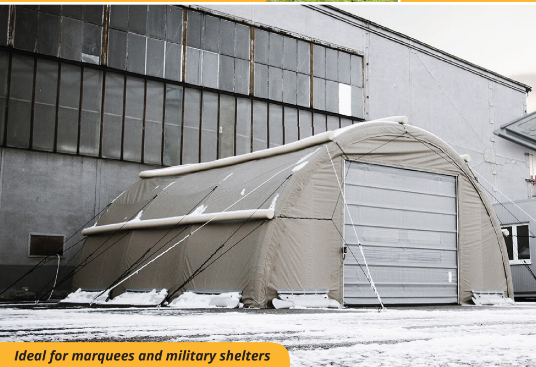
Ideal for marquees and military shelters