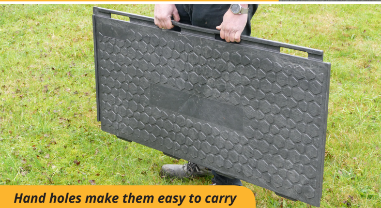
Hand holes make them easy to carry