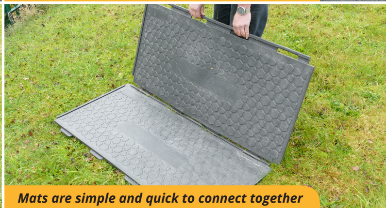
Mats are simple and quick to connect together