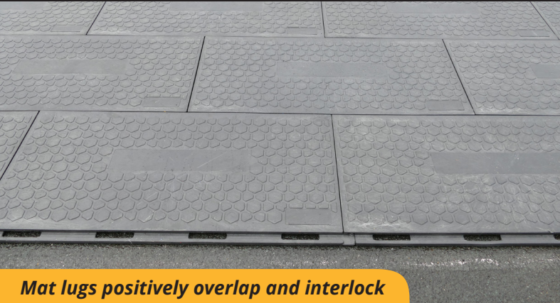
Mat lugs positively overlap and interlock