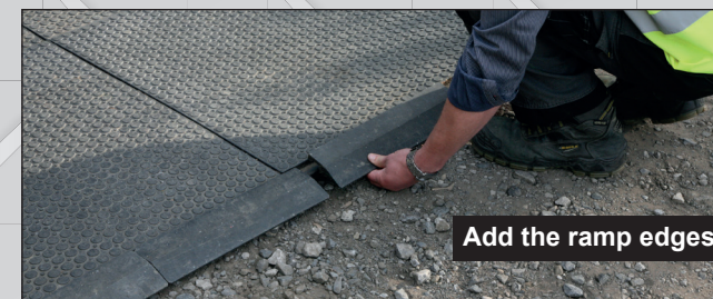
Add the ramp edges

Complete the area by adding edge ramps to ensure there are no trip hazards.