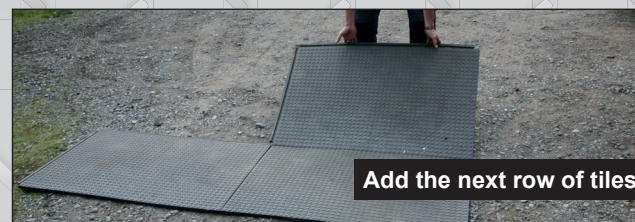
Add the next row of tiles

Start laying in the right hand corner of the proposed area, placing the next tiles over the joining lips.