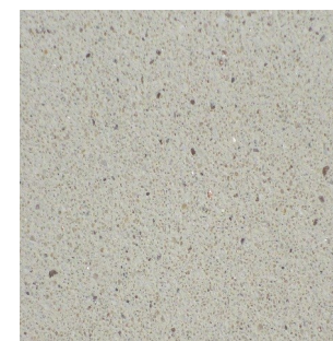
B103 Sahara (B)