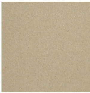
B100 Bath (A)