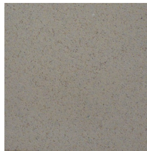
B107 Ivory (A)