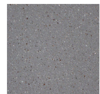
G101 Steel Grey (B)