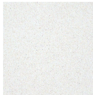
P100 Portland (A)