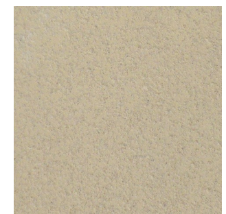
B104 Denby (A)