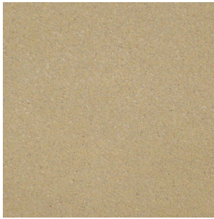
B106 Sherwood (A)