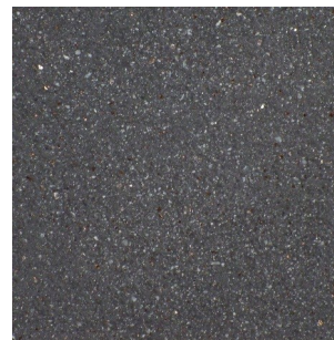
G109 Comet (B)