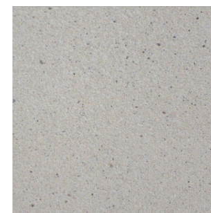
B108 Nevada (B)