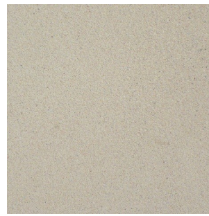
B101 Sand (A)