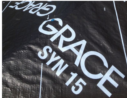
GRACE® SYN 15™

Grace® SYN 15™ synthetic underlayment weighs half of #15 felt, enabling fast and easy installation