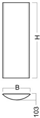
KABRIO square shaped