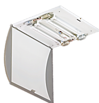
KABRIO hinged diffuser