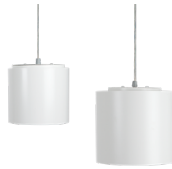
Pendant downlight in two sizes