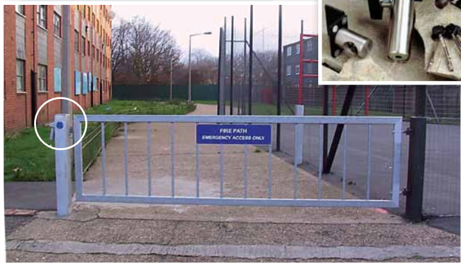
The communal parking area at Nelson Mandela House