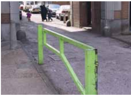
Gates left or pinned open will not prevent unauthorised access