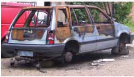
Abandoned vehicles present dangers

Health & safety issues with nuisance parking or abandoned vehicles are costly. Local authorities have a duty to remove an abandoned vehicle if it is on land in the open air or any land forming part of a highway 4 .