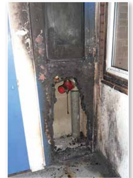
A fire door (non Gerda fire door) subject to arson, exposing the dry riser - important equipment that the Fire & Rescue Service needs in full functioning order.

The Fire Protection Association, in its latest October 2012 edition of “The Prevention and Control of Arson”, states: