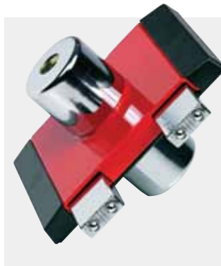
Key operation both sides for rooftop environments

The FDS Service Room Doorsets™ are fitted with the Gerda H System™, a locking system that offers high performance and security with improved key control to the customer for restricted areas.