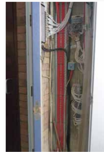
A breached fire door (non Gerda fire door) exposing the contents of the electrical intake cupboard which, if damaged, could significantly affect the building.

By looking at the design of the doorset, cost savings can be made in terms of maintenance, while at the same time assisting with this legal requirement.