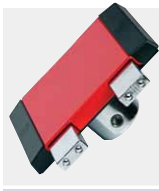
For cupboards and cabinets

Enabling immediate Fire & Rescue access in critical situations through the unique Gerda One Key® System for the Fire & Rescue Service 1 .