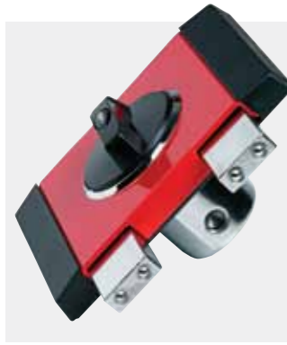
For enclosed areas of restricted access ensuring means of escape