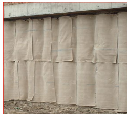
perfect for secant piled walls