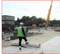
suitable for ground applications

Proofex Hydromat can be rolled out onto the ground, fixed to the shutter before casting concrete, or simply fixed to the retaining wall after casting. Compatible with Fosroc's complete range of structural waterproofing products, Proofex Hydromat gives maximum protection to your watertight substructure.