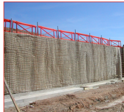
ideal for vertical applications