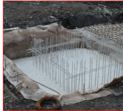
flexible for lift pit and complex details