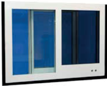
Internal View - Open