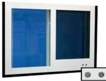
Internal View - Flush Operation