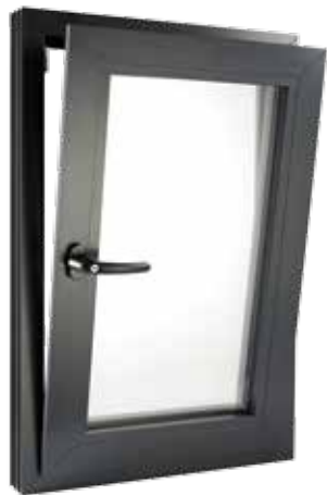
Tilt mode - top ventilation position

Note that these windows have an 'anti-switch' barrier, which means that they cannot be accidentally moved from tilt to turn mode. The only way to switch modes is to push the window closed and turn the handle.