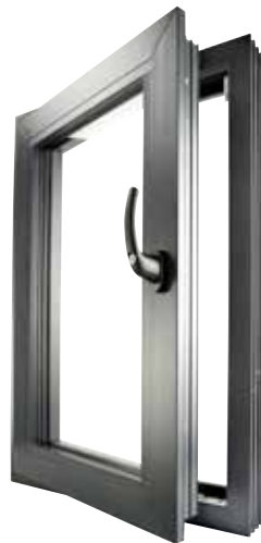
Turn mode - maximum ventilation and for cleaning of outside pane