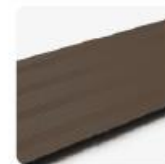
Sepia Brown 8014