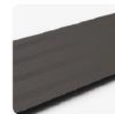
Grey Brown 8019