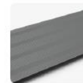
Dusty Grey 7037