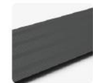
Anthracite Grey 7016