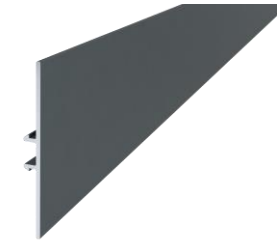
Butt Gap Ends Cover