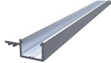
Covering Clip Rail