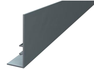
Start / End Cover