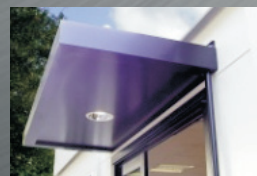
Modular / off-site