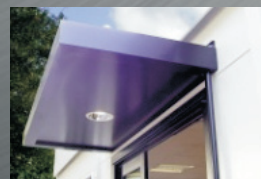
Modular / off-site