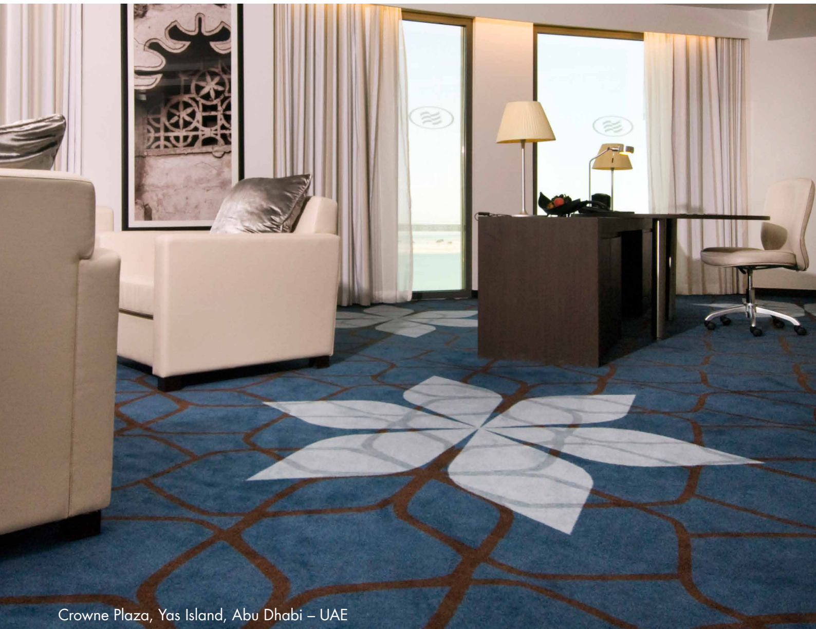
Crowne Plaza, Yas Island, Abu Dhabi – UAE

The instructions have been made in accordance with the latest, available information and will be regularly updated.