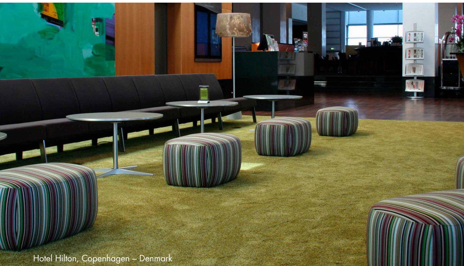
Hotel Hilton, Copenhagen – Denmark

See special tips for joining of egetæpper's contract loop products with DL backing on the next page.