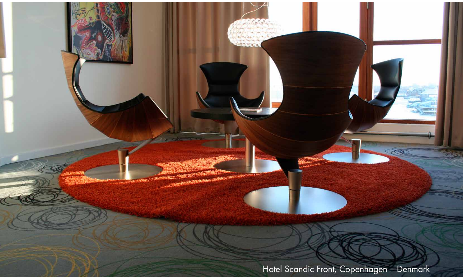
Hotel Scandic Front, Copenhagen – Denmark

The carpet is laid on a subfloor and tightened using grippers.