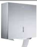
WP 163 page 58