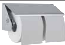
WP 149 page 57