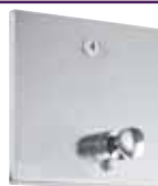
WP 106 page 11