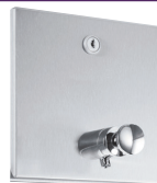
WP 106 page 11