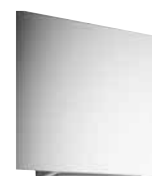
WP 176 page 109