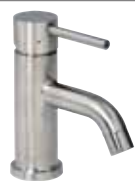
DB 1650 page 176