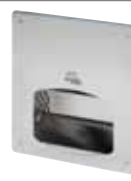
BC 2200SA(R) page 160