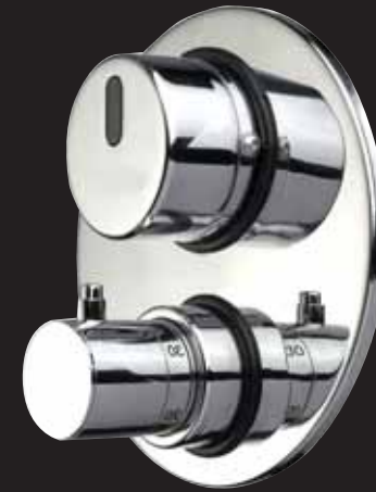
DB1200 Semi Recessed