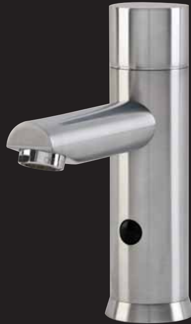
DB 100 dolphin blue electronic infrared tap