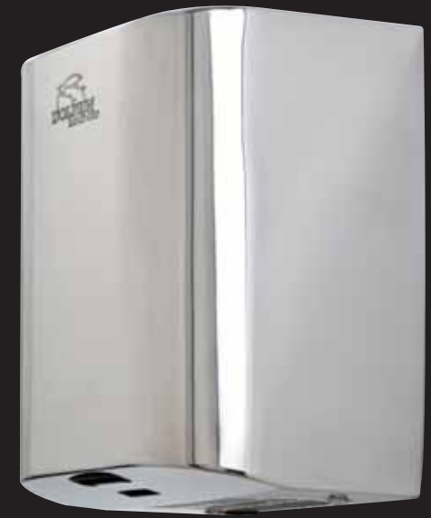
DB 2001 dolphin velocity hot air drier