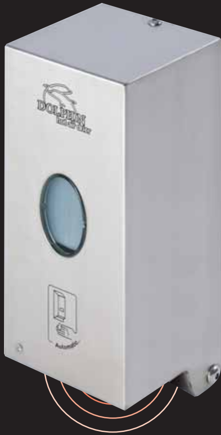
BC 950 dolphin infrared automatic hands free soap dispenser