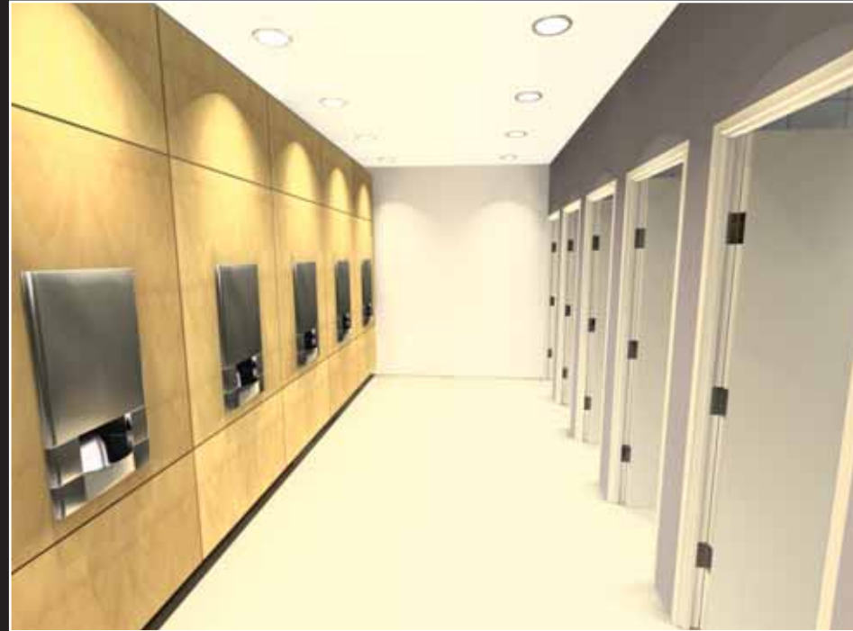
BC 30SCA dolphin wash station