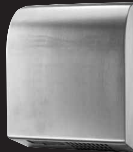
BC 2201 dolphin stainless steel dolphin hot air hand dryer