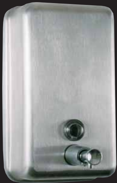
BC 923 dolphin stainless steel vertical soap dispenser