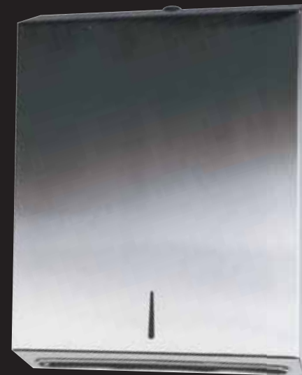
BC 928 dolphin stainless steel maxi paper towel dispenser