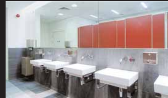
Design and Sustainability in the Washroom