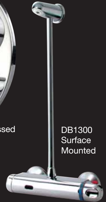
DB1300 Surface Mounted