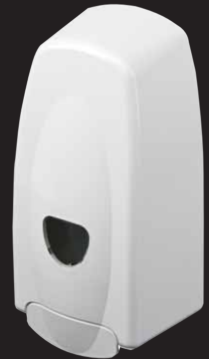
BC 123 / BC 124 dolphin plastic soap dispenser