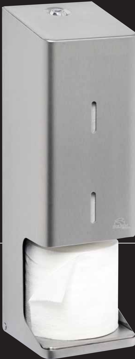
BC 300S Dolphin Stainless Steel 3-Roll Toilet Roll Holder