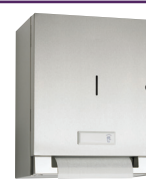
DP 3107 page 103