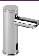
DB 200 page 178