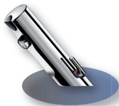
TEMPOMATIC MIX 4 : Mixer version with or without stopcocks. DELABIE ref.: 490006

All illustrations are available on the enclosed CD-Rom: