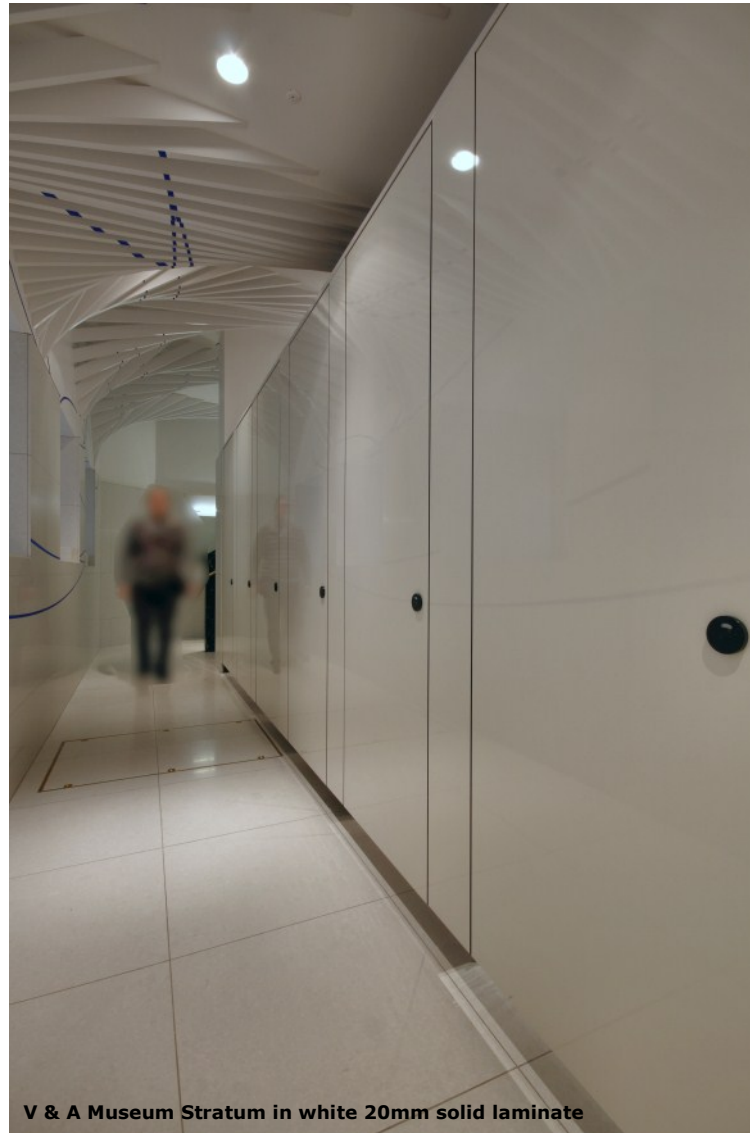
V & A Museum Stratum in white 20mm solid laminate

Decra Ltd 34 Forest Business Park Argall Avenue London. E10 7FB Tele: 020 8520 4371 Fax: 020 8521 0605 Email - sales@decraltd.co.uk www.toiletcubicles.org