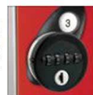
CODE RE-PROGRAMMING 4 DIGIT AND FINDING USING SERVICE KEY