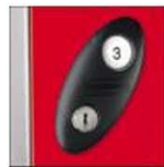
*STANDARD CAM LOCK