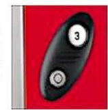
RADIAL PIN LOCK