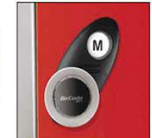
SIMPLE DIGITAL RFID LOCK