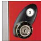
COMBINATION LOCK 3 DIGIT A simple and effective 3 digit code, making losing