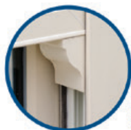
Close up of white reveal with cream foil