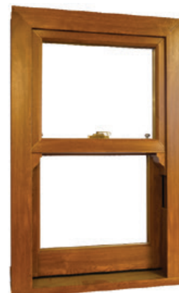
Golden Oak Foil