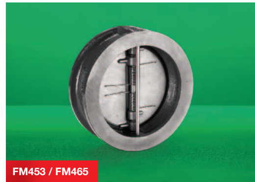
FM453 / FM465