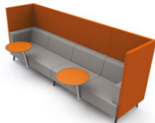
High back four seat sofa with boom table