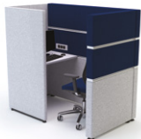
800 Single acoustic enclosure