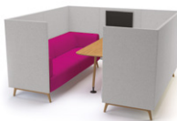
6 Seater booth with black or polished aluminium legs and integrated work surface