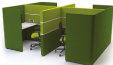
1200 Quad acoustic enclosure