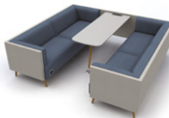
Low back booth with integrated work surface