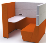
1200 Single acoustic enclosure with bench