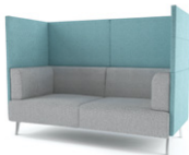
High back two seater sofa with black or polished aluminium legs