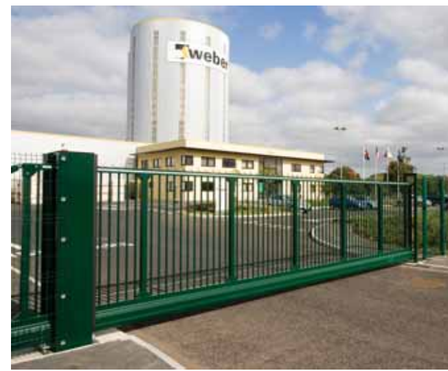
Fully automated CLD SlideMaster cantilever sliding gate