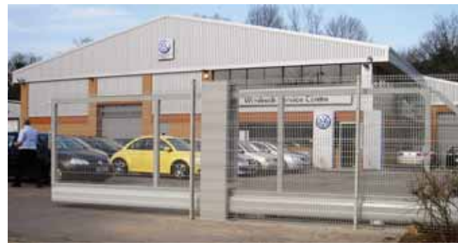
SlideMaster cantilever gate

The CLD SlideMaster cantilevered and tracked sliding gates are made to order and can be supplied with a height of up to 3.0 m with a drive through width of up to 20 m, all with 125 mm ground clearance.