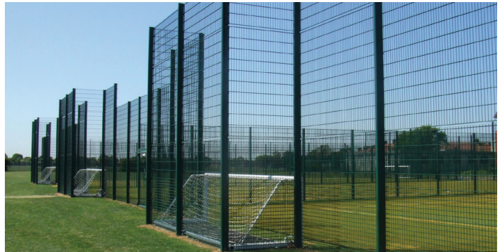
CODI "M" INSTALLATION (ABOVE)