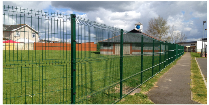
CODI "C" INSTALLATION (ABOVE)