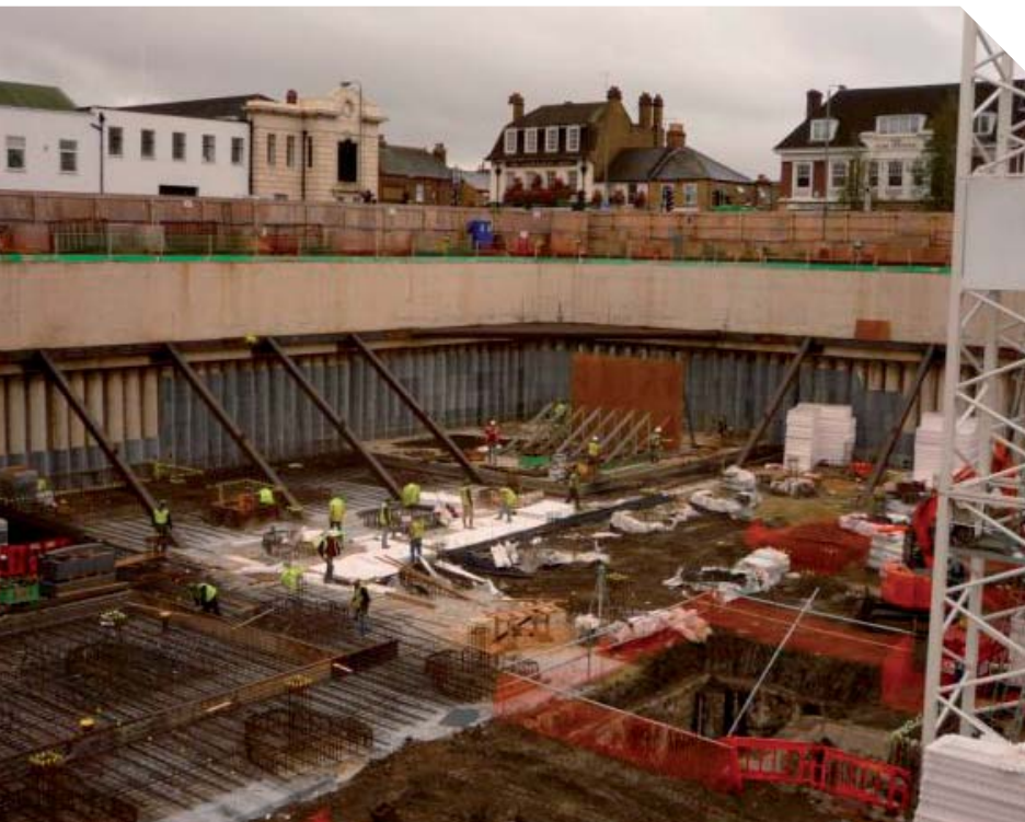
A prime example of CETCO offering the complete waterproofing package from basement slab to walls and podium decks

Birch House, Scott Quays, Birkenhead, Merseyside CH41 1FB +44 (0)151 606 5900