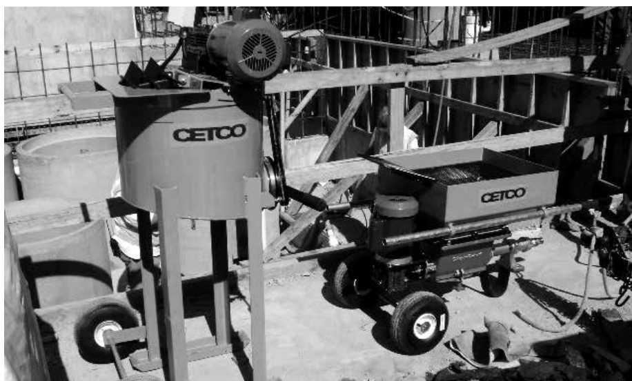
Figure 2: CETCO pump and mixer with electric 1HP motor

Insert injection pipe as close as possible to the foundation wall at 0,6 m–1,2 m on centre and push pipe down to the top of the footing or the desired depth. Use a “Tile Rod” or long drill bit to start the first few feet of the injection hole.