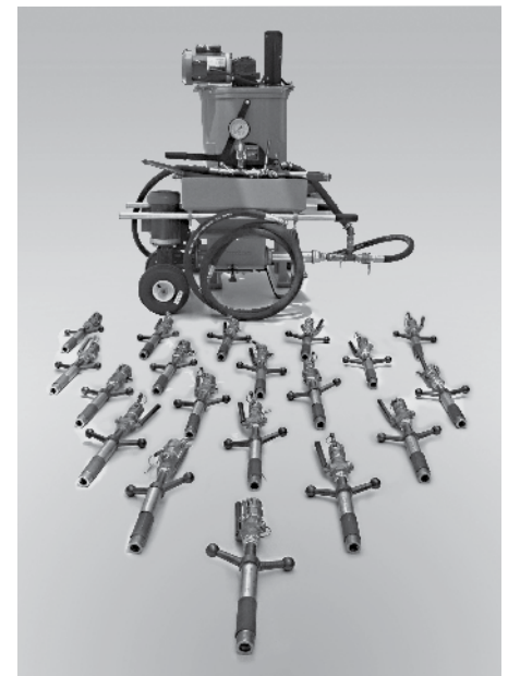
CETCO BENTOGROUT Pump, Mixer and Accessories

Caution: Pumping any material under pressure can cause lifting or movement of adjacent structures.