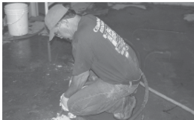
STRUCTURAL SLAB APPLICATION: Inject BENTOGROUT under an existing slab to provide waterproofing and fill void areas