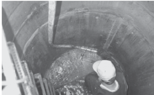
INTERIOR THROUGH WALL APPLICATION: BENTOGROUT injected to the exterior of a manhole through pre-drilled holes using a short injection wand